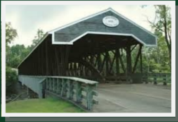
Saco River Covered Bridge

The Northeast Bridge Preservation Partnership is a regional forum of bridge practitioners working together to promote the benefits of Bridge Preservation through information sharing, education and application.